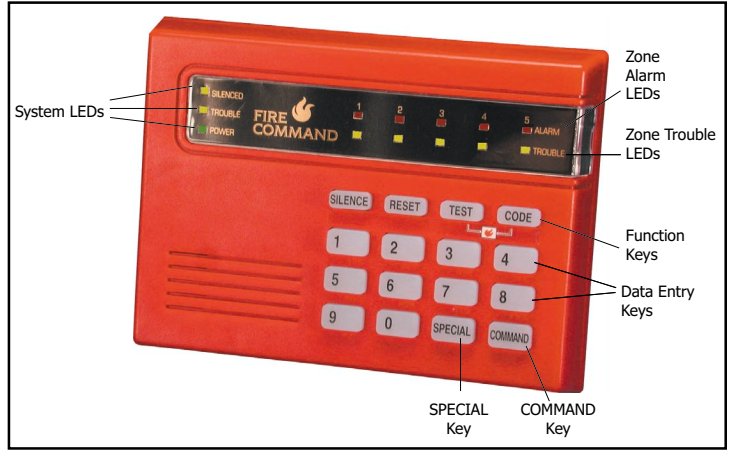
Figure 2: 692F LED Keypad

This device has been placed at locations throughout the premises to allow you to properly operate the system.