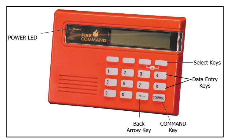
690F Fire Command Keypad

This device has been placed on the premises to allow you to properly operate the system and review previous event history. The keypad provides a passcode protected User Menu where you can access the functions needed to operate the system. See Keypad User Menu . In addition to the User Menu, the items below list operational features of your keypad.